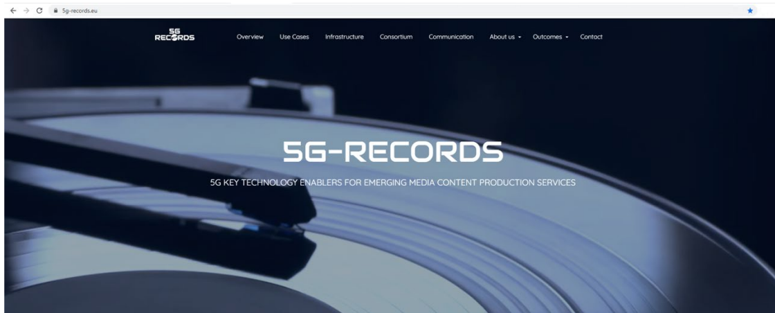
Figure 1. 5G-RECORDS website.

The project website 4 , managed by UPM, was unveiled in September 2020 at the beginning of the 5G-RECORDS project. The public portal comprises static contents (e.g. main project objectives, consortium, use cases, infrastructure, etc.) and dynamic contents (e.g. partners' news, videos, events, FAQs etc.).