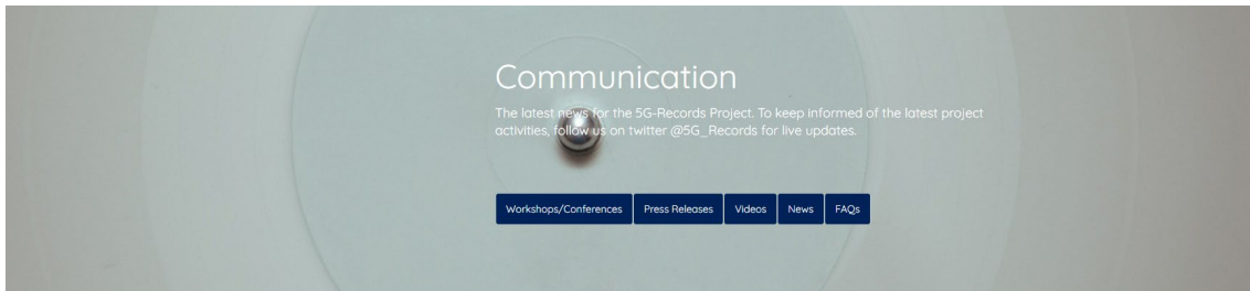
Figure 3. 5G-RECORDS communication 6 .

The portal web is being regularly updated with all information facilitated by partners and contacts of the project with news about the project and relevant 5G topics.